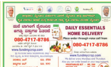
Fund My Crop-Home Delivery of Essential items