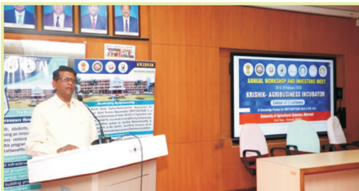
Investor's Meet, KRISHIK- ABI, UAS, Dharwad