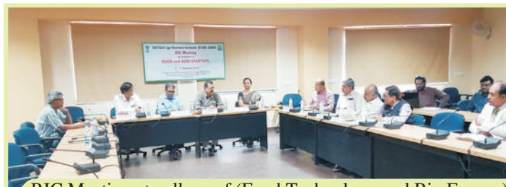
RIC Meeting at college of (Food Technology and Bio Energy), Anand Agricultural University, Anand, Gujarat