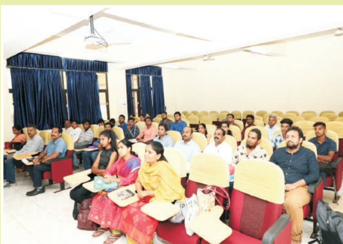
Inauguration of Second Cohort by Hon'ble Vice Chancellor, UAS, Dharwad