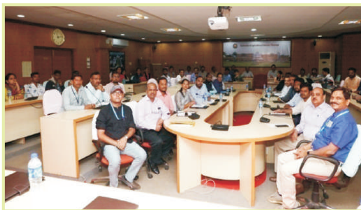
Inauguration of One Day Annual workshop at KRISHIK-Agri Business Incubator, UAS, Dharwad