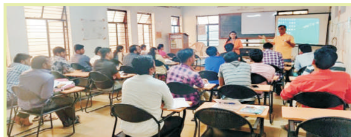
Agri-clinics and Agri-Business Centre, UAS, Dharwad

Team KRISHIK-ABI was instrumental in sensitization and outreach programs conducted for raising awareness. The team visited KISAN AGRI SHOW at Pune, IKP & National Institute of Agricultural Extension Management (MANAGE), Hyderabad, KLS Gogte Institute of Technology & IKP-KTECH Innovation Hub - Belagavi, Ramanata Crisna Pai Raikar School Of Agriculture, Ponda, Goa, Agri Clinics and Agribusiness Cell, Dharwad and other colleges in Hubli and Dharwad region.