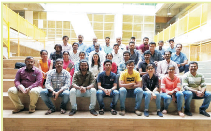
Training sessions at Deshpande Startups, Hubli