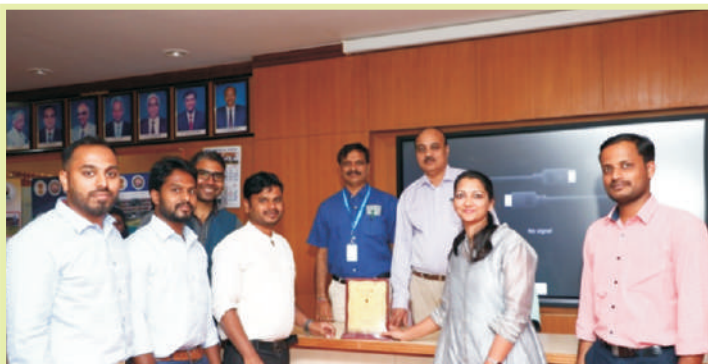
Best Incubator award was given to NIVEDI'S NaaVic Bengaluru