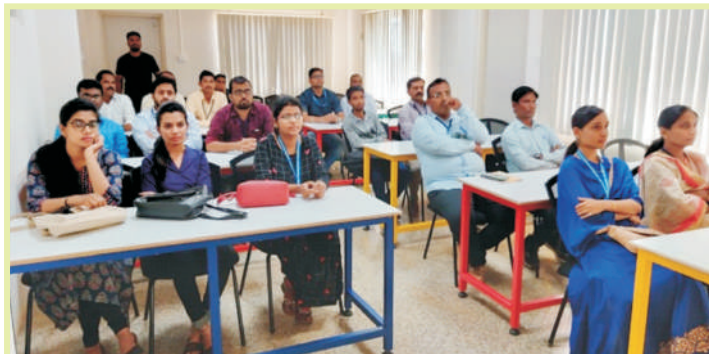
Visit to K-Tech Innovation Hub, Belgavi