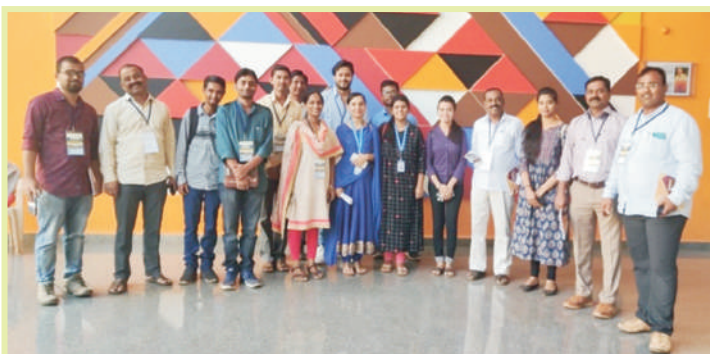
Visit to KLS Gogte Institute of Technology, Belgavi

Anveshan and Avishkar trainees visited the Technology and Business Incubation Cell KLS Gogte Institute of Technology and IKP- KTECH Innovation Hub, Belgavi on January 31, 2020 to gain exposure to the facilities and schemes available in different incubation centres.