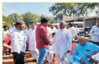
KRISHI MELA, Vijayapura