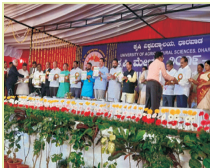
Honourable Deputy Chief Minister Laxman Sangappa Savadi Releasing Krishik-ABI News Letter

Krishi Mela, a mega event which attracts lakhs of farmers and other Stake Holders, was organized at UAS, Dharwad from January 18-20, 2020. Team KRISHIK-ABI had organized demo day during Krishi Mela for the selected Anveshan and Avishkar trainees enabling them to showcase their innovative ideas, prototype products and samples. Assignments were also given to Anveshan trainees to enhance their understanding about needs of farming community, scope of agribusiness and the practical application of learnt ideas to their respective startups. The first volume of KRISHIK-ABI Newsletter- "Farm, Food and Life" was inaugurated by Sri. Laxman Savadi, Deputy Chief Minister, Government of Karnataka. Other dignitaries present at the occasion were Sri. Pralhad Joshi- Union Parliamentary Affairs Minister, Sri. Suresh Angadi Union Minister of State for Railways, Sri.C.C. Patil Mines and Geology Minister