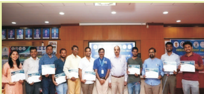
Valedictory of 2 Month Training Program of First Cohort.