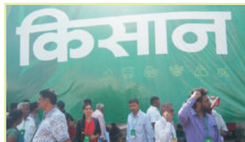
KISAN India's Largest Agri Show, Pune