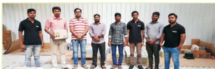
Symgrow Technologies Deshpande Startups, Hubli